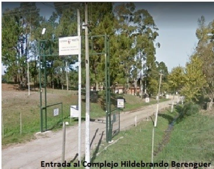
Entrada al Complejo Hildebrando Berenguer

We continue working very hard to give our future visitors the best attention, in what will be our second Gathering in our country.